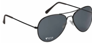
Vector Aviators $7