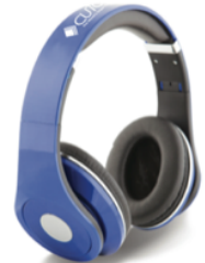
Cutco Headphones $25