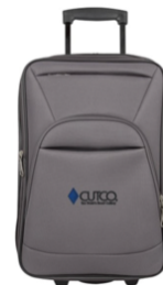
Cutco Demo Bag (Carry on size) $70