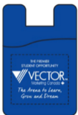
Vector Smartphone Wallet $4