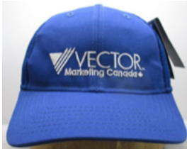
Vector Hat $20