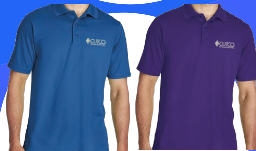
Cutco Polo Shirt (Unisex) Purple or Blue $30

How to Order: Email your order to mchesney@cutco.com